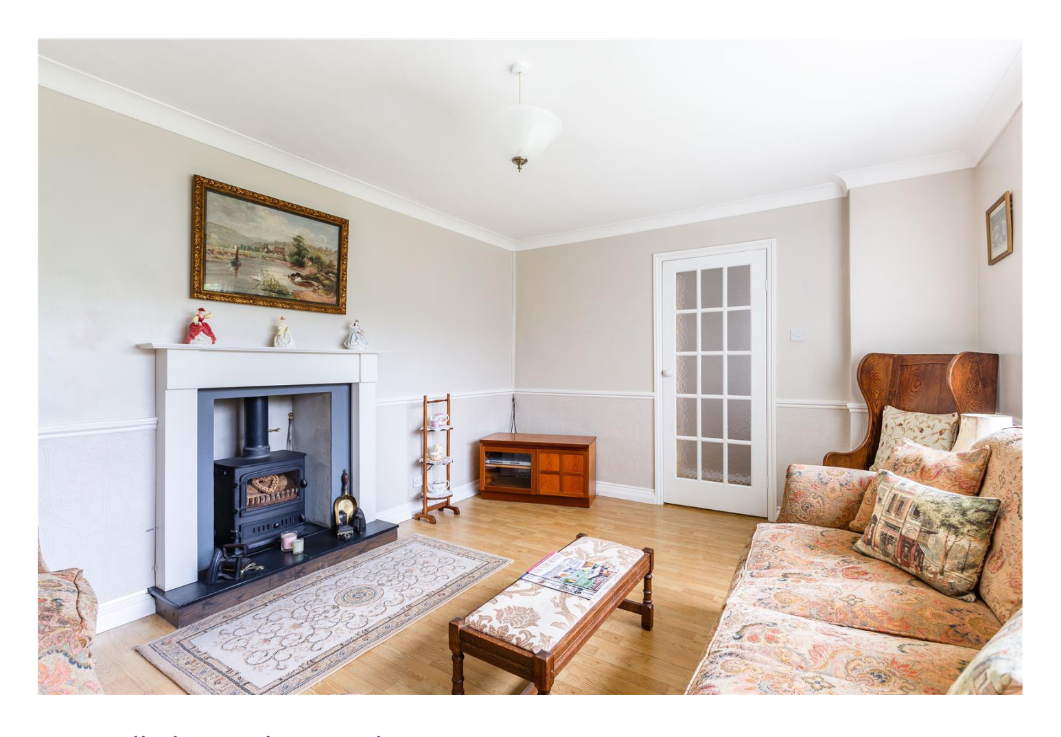
15, Well Plot, Loders, Bridport, Dorset, DT6 4NP Guide Price £335,000

A beautifully presented two bedroom semi-detached bungalow situated on the edge of the picturesque village of Loders. Offered with no onward chain.